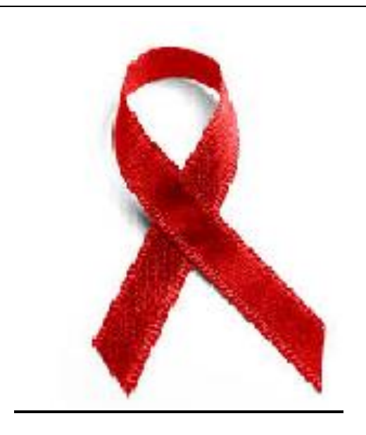
HIV/AIDS IN SWAZILAND: A BIBLIOGRAPHY