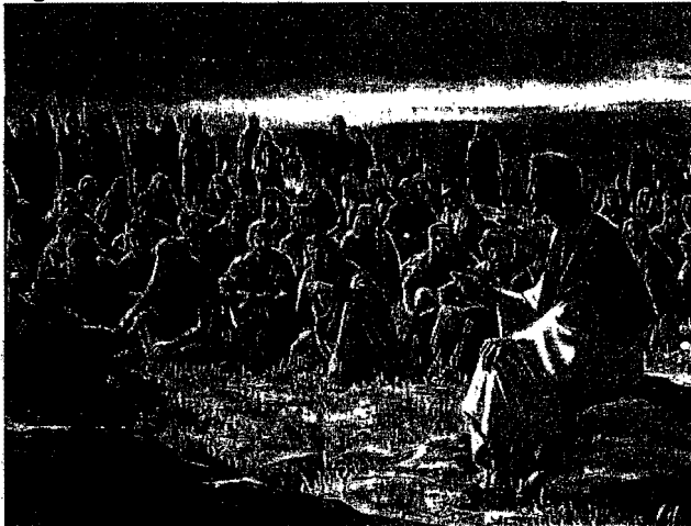
Jesus teaching on the sermon on the plain

In the sermon on the plain, Jesus taught his disciples what a true disciple is. Gospel writers like Matthew refer to these teachings as the Beatitudes. The Beatitudes contain blessings, rewards and promises, as well as warnings and curses for other groups of people that lived in Jewish society at the time.