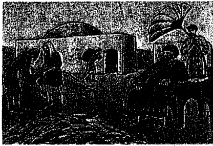
A man accumulating wealth