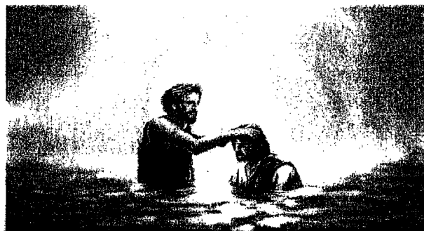
John baptizes Jesus