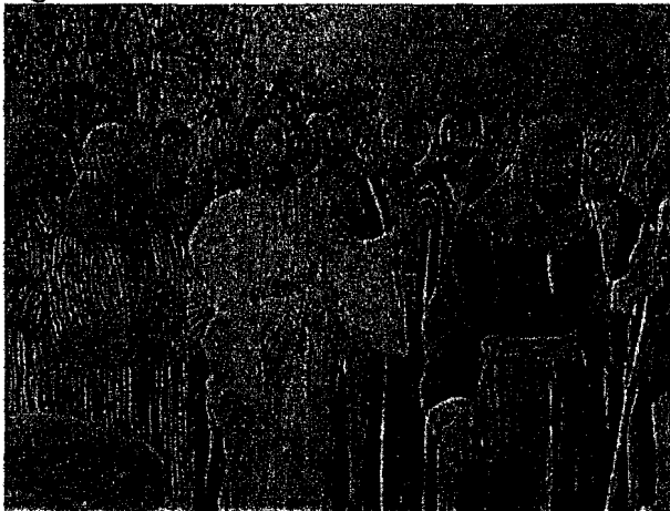
Drawing of Jesus and his disciples