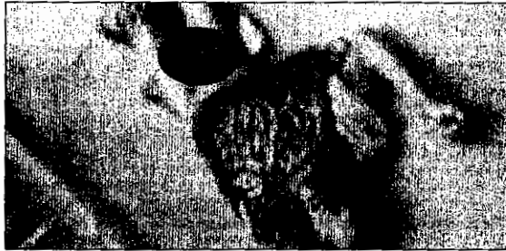
MSUNDUZA - The 24-year old man who was on Sunday morning severely beaten after being caught allegedly raping a 46-year old woman at Msunduzi location.

The resident, after some minutes, then decided to enlist help from people who were in the shebeen and they came in their numbers to see